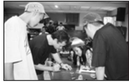
Training started on January 11, 2009 with 11 participants coming from barangays Camp Allen, Fairview, Quezon Hill Proper, Camp 8, City Camp Central and Lourdes Subdivision Extension. Participants were organized with the help of Barangay Officials.